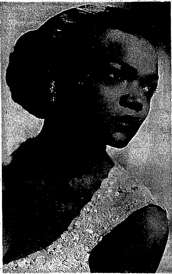
Files For Divorce

Johnson, 47, lost three earlier races for governor, but in this campaign he capitalized on the University crisis and opposition to the Kennedy administration to sweep the state with the exception of a few counties in Coleman's native northeast.