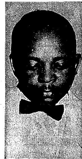
On Advisory Board