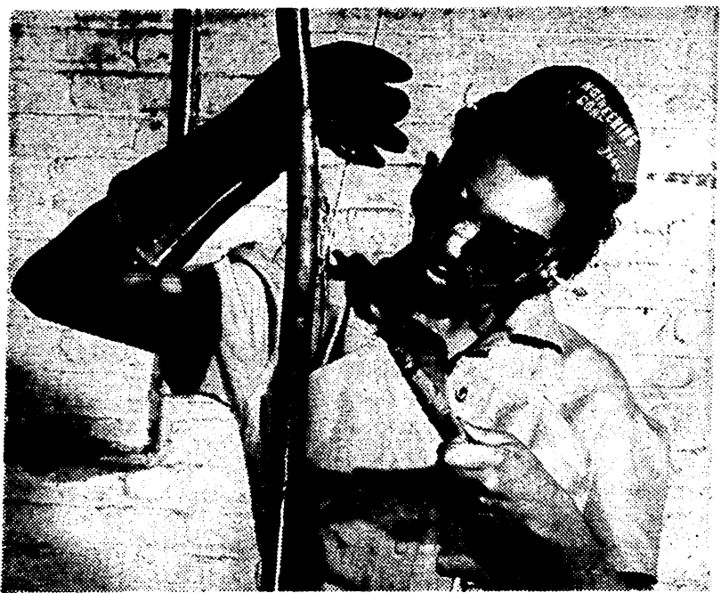
Nat. Negro Congress worked to bring Negroes into war production.